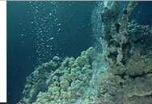
Submarine in the deep sea