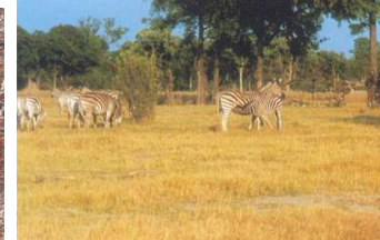
Tropical Semi-arid Grassland (Savanna)