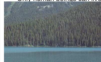
Boreal Conifer Forest