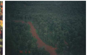
Tropical Rain Forest