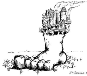
Fig. 1. The ecological footprint. The ecological footprints of individual regions are much larger than the areas they physically occupy. Since industrial economies draw on resources from all over the world, we say that they are in effect appropriating carrying capacity from elsewhere, including the global commons (Phil Testemae).