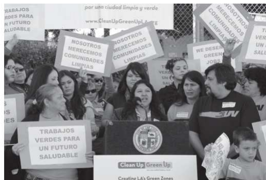
Figure 11.5 Members of Clean Up Green Up, an L.A. Environmental Justice Advocacy Group, Hold a Press Conference in Support of Their Goals

As part of empowering LA http://empowerla.org/tag/clean-up-green-up/