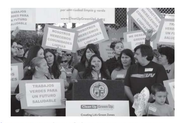
Figure 11.5 Members of Clean Up Green Up, an L.A. Environmental Justice Advocacy Group, Hold a Press Conference in Support of Their Goals

As part of empowering LA http://empowerla.org/tag/clean-upgreen-up/