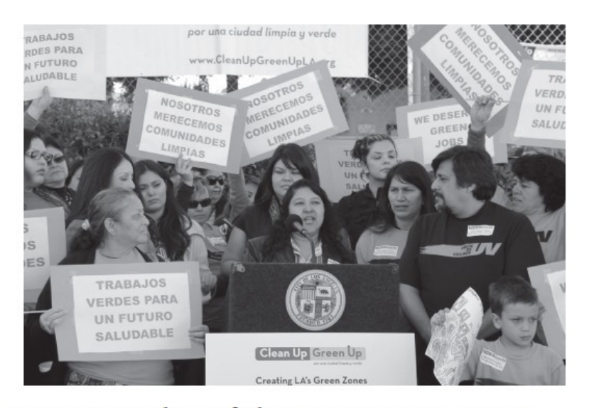
Figure 11.5 Members of Clean Up Green Up, an L.A. Environmental Justice Advocacy Group, Hold a Press Conference in Support of Their Goals