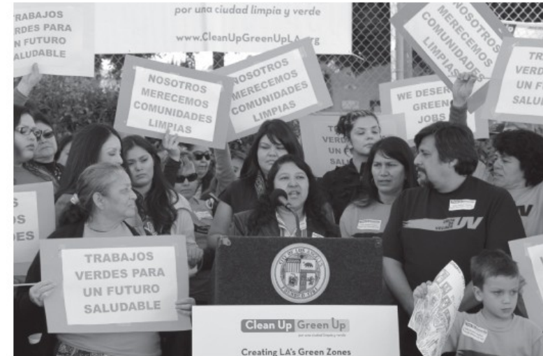
Figure 11.5 Members of Clean Up Green Up, an L.A. Environmental Justice Advocacy Group, Hold a Press Conference in Support of Their Goals